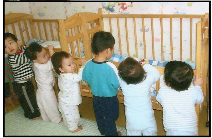
Babies welcoming new members

This month's letter may not make much sense, but it is true that I am learning much about life from them. I was watching the babies the other day and I thought that I heard one baby say, "abba." It's Biblical word for "Dad" and I wondered where they learned Greek.