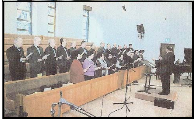
SENIORS' PREACHERS' CHOIR

It may be THE OLDEST AND THE BEST CHOIR in the world. One project I had in mind as I became the President of the Senior Pastors' Association was to organize a SENIOR PREACHERS' CHOIR, so it started last month. Their average age is 80 and the oldest is 88 and they are good singers as most of them used to be Choir Directors in their churches. We decided to use up our talents for the Lord. .