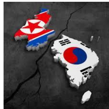
War-torn Korea: South and North

and that's what you and I are trying to do in this part of the world. One of our mottos, which I printed on my recent CD is "OUR LIVES FOR ASIA, ASIA FOR THE WORLD AND THE WORLD FOR CHRIST." If you want to see that CD, just let me know.