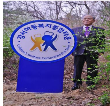
Our new Sign Board!

work for us. So if you need a missionary speaker or a camp missionary or anything, please contact my son. His contact information is printed on the back of this newsletter.