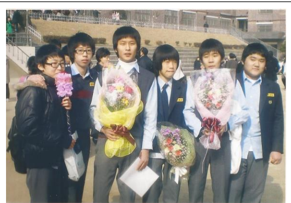
Our graduating class of 2014!

Crying to God is also the expression of our faith. We cry through prayers, because we are desperate, but also believe that God listens to our prayers. I remember when I faced strong walls (dead ends) during my ministry.... when I was not going anywhere, and people refused to respond, I went to the mountains, usually fasting prayer gardens, to cry to God. I cried to God fasting for days. And when I came down and preached, somehow people started to cry. So, go ahead, CRY TO GOD!