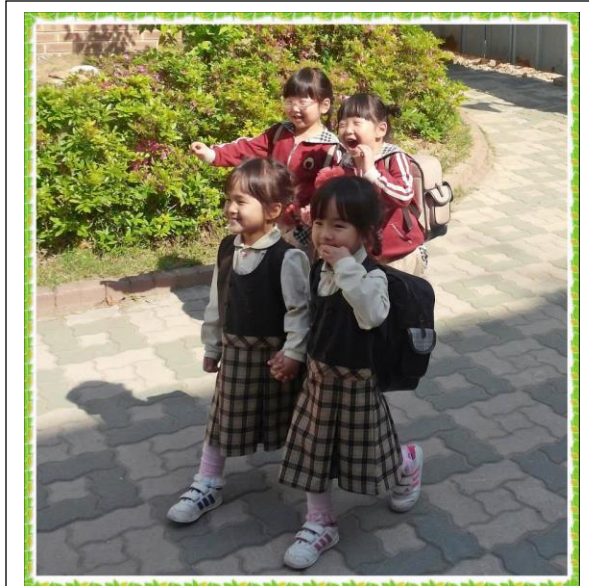
Excited and in uniform for the first day of school!