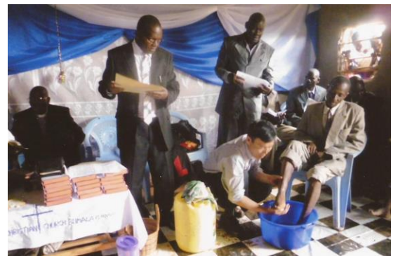
Washing feet in Kenya

One of our Christian University students came to me, many years ago, and asked me to conduct his funeral. I answered "You are not dead. It's more likely that you have to conduct my funeral." He said, "I want to make sure that 'I have been crucified with Christ; and it is no longer I who live....'" That young man is now a missionary in Africa, and the other day, he sent me this picture of 'washing feet' in Kenya.