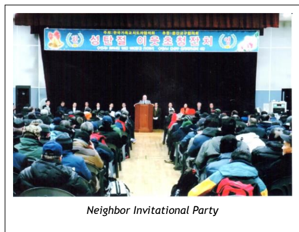
Neighbor Invitational Party

unexpected situations for the salvation of the world, I know that God will change the unexpected situation of the homeless for the Victory of all!