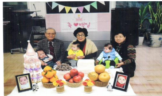
100 Day Celebration for our new babies

Every minute is crisis. You can't take your eyes off them even one second. How thankful we are to the social workers (dorm mothers) who take care of them 24 hours everyday. And how thankful we are to our God who takes care of all of us every second of everyday. Some of our babies were abandoned in Church baby-box. I was talking to some of our workers the other day that perhaps MARY MIGHT HAVE BEEN TEMPTED TO USE THE BABY BOX, if she lived today. How grateful we are that she didn't -- and instead, watched Jesus being nailed on the Cross.