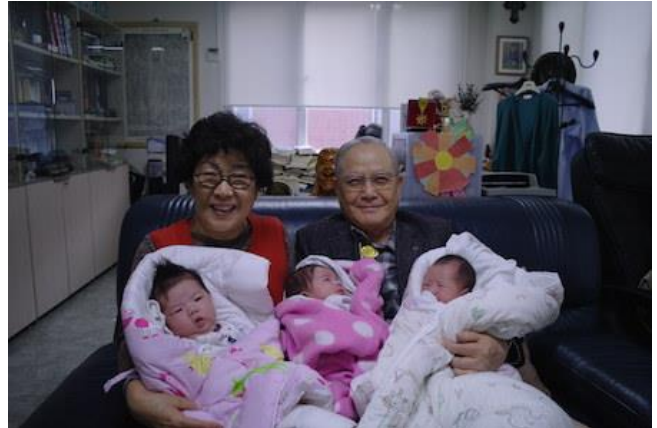
Christmas Gifts from God

For instance, there were more than a few times, when we didn't have enough food to feed our children, but in these times, last minute help always came. So "GOD ALWAYS PROVIDES" is my testimony and that's my lips evangelism. And that's what God commanded to the people of Israel to keep reminding people that God saved them by the blood of the Lamb in Egypt and at Golgotha (Exodus 12).