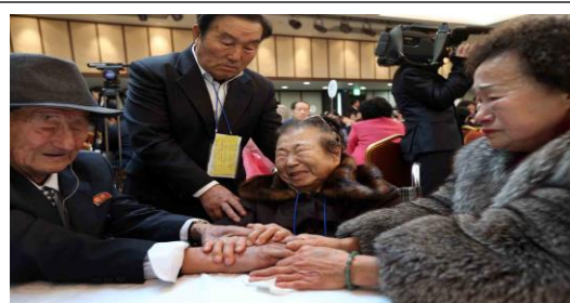
The most recent North/South Korea family reunion

the Korean War, still I am afraid that there are too many separated families. Our government has proposed to North Korea to arrange the family union meeting this month, but I am afraid that there has been no response from North Korea.